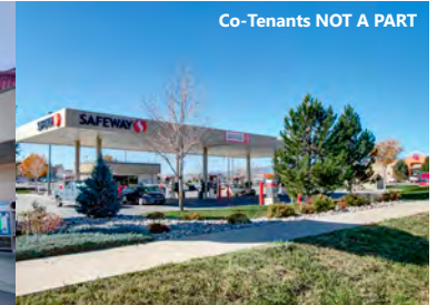
Co-Tenants NOT A PART