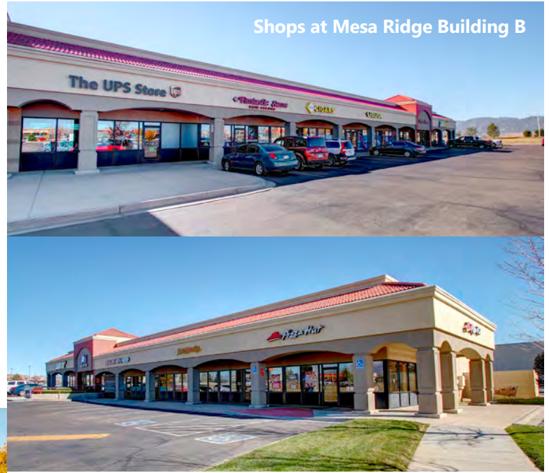
Shops at Mesa Ridge Building B