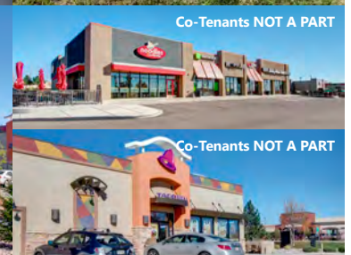
Co-Tenants NOT A PART