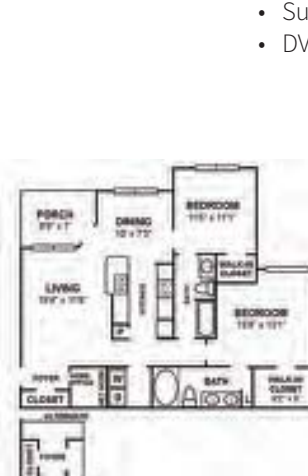
2 Bedroom / 2 Bath