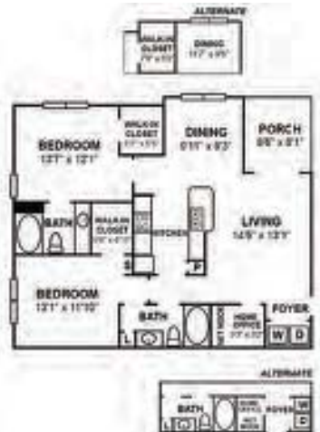
2 Bedroom / 2 Bath