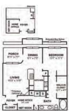
1 Bedroom / 1 Bath