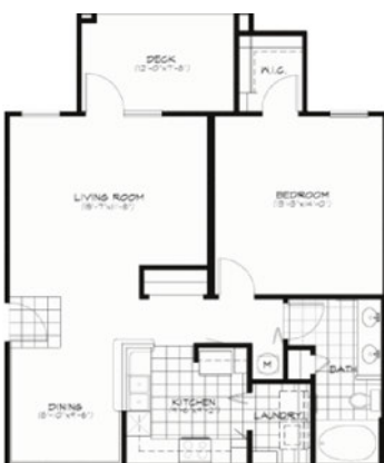
1 Bedroom/1 Bath 876 Square Feet