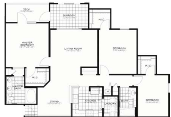
3 Bedroom/2 Bath 1,497 Square Feet