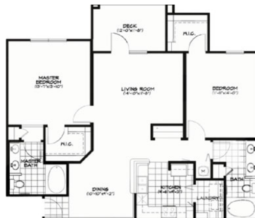
2 Bedroom/2 Bath 1,227 Square Feet