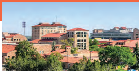
View of campus from the north side of Plaza on Broadway.