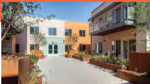
Quaint outdoor common areas

Plaza sits directly across the street (Broadway) from campus. Plaza residents are closer to classrooms than most student parking lots. Nelson Brothers views this as an A location, something that is very important to students and difficult for competitors to replicate.