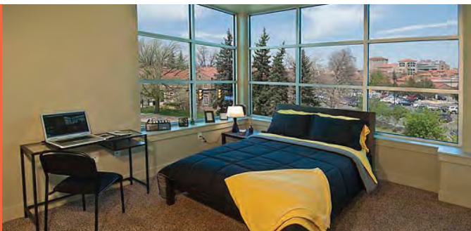
Campus view from bedroom

Plaza on Broadway is a new, 2013-built, Class A property within a block to the 31,000-student CU campus.