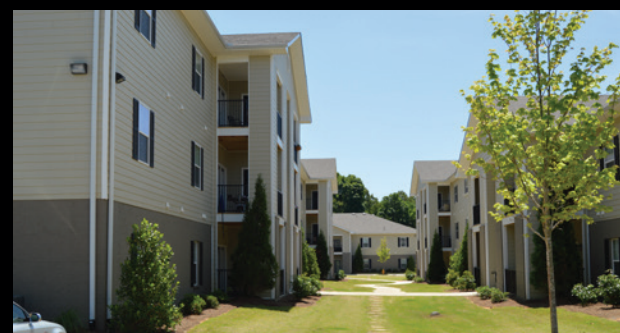
Inviting, well-manicured grounds