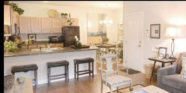
Spacious and open floor plans