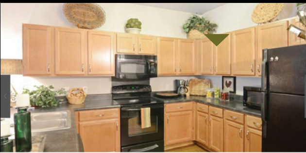
Large, modern kitchens