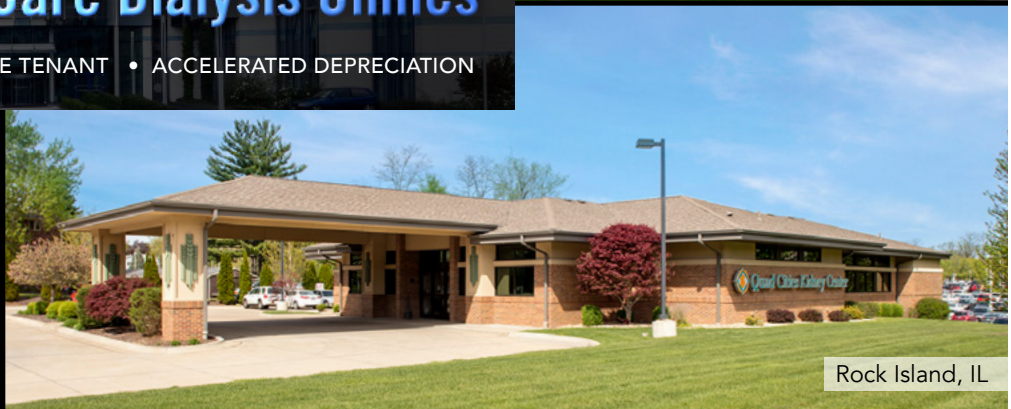
Rock Island, IL