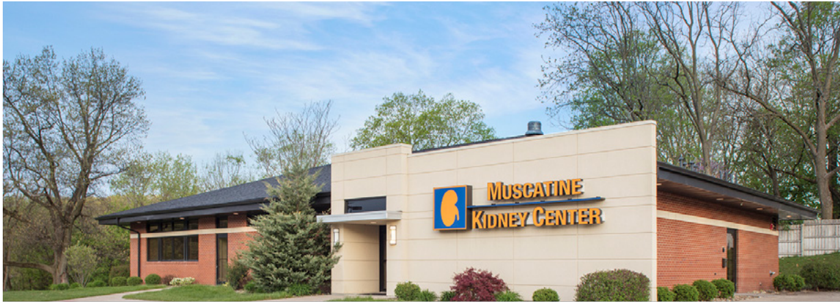
FRESENIUS MEDICAL CARE MUSCATINE 311 PARHAM ST. • MUSCATINE, IA

Rentable Square Footage: 4,609 Lot Size: .87 Acres