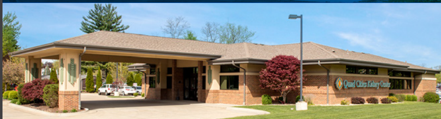
ROCK ISLAND, ILLINOIS