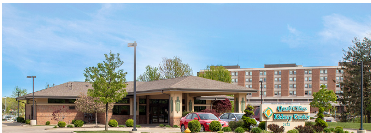
FRESENIUS MEDICAL CARE ROCK ISLAND 2623 17TH STREET • ROCK ISLAND, IL

Rentable Square Footage: 6,050 Lot Size: .82 Acres