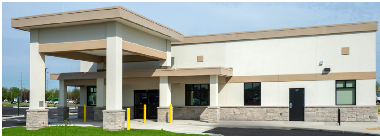
FRESENIUS KIDNEY CARE EAST DAYTON 821 EDWIN C. MOSES BLVD • DAYTON, OH

Rentable Square Footage: 8,419 Lot Size: 0.9 Acres