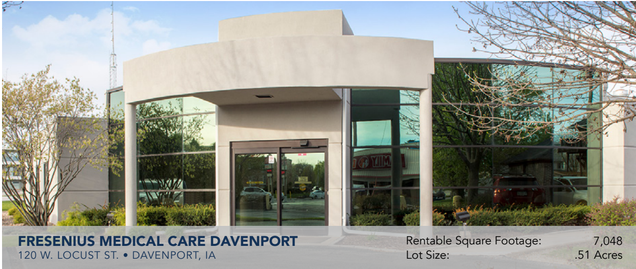
FRESENIUS MEDICAL CARE DAVENPORT 120 W. LOCUST ST. • DAVENPORT, IA

Rentable Square Footage: 7,048 Lot Size: .51 Acres