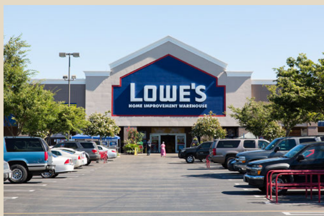
Costco and Lowe's Home Improvement Warehouse: Shadow anchors which generate traffic for the Property.*