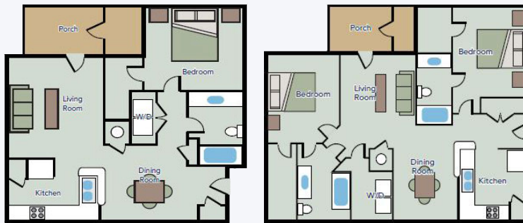
1 Bed / 1 Bath