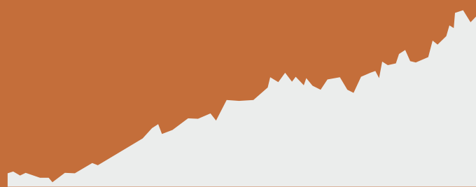
NYSE: AZO - 5-Year Stock Performance

CURRENT ANNUAL NET INCOME: $1.07 BILLION