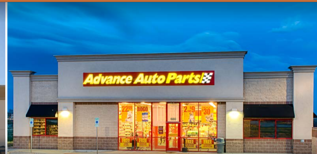
Pictures representative of similar corporate-backed stores and are not the actual locations included in the portfolio.