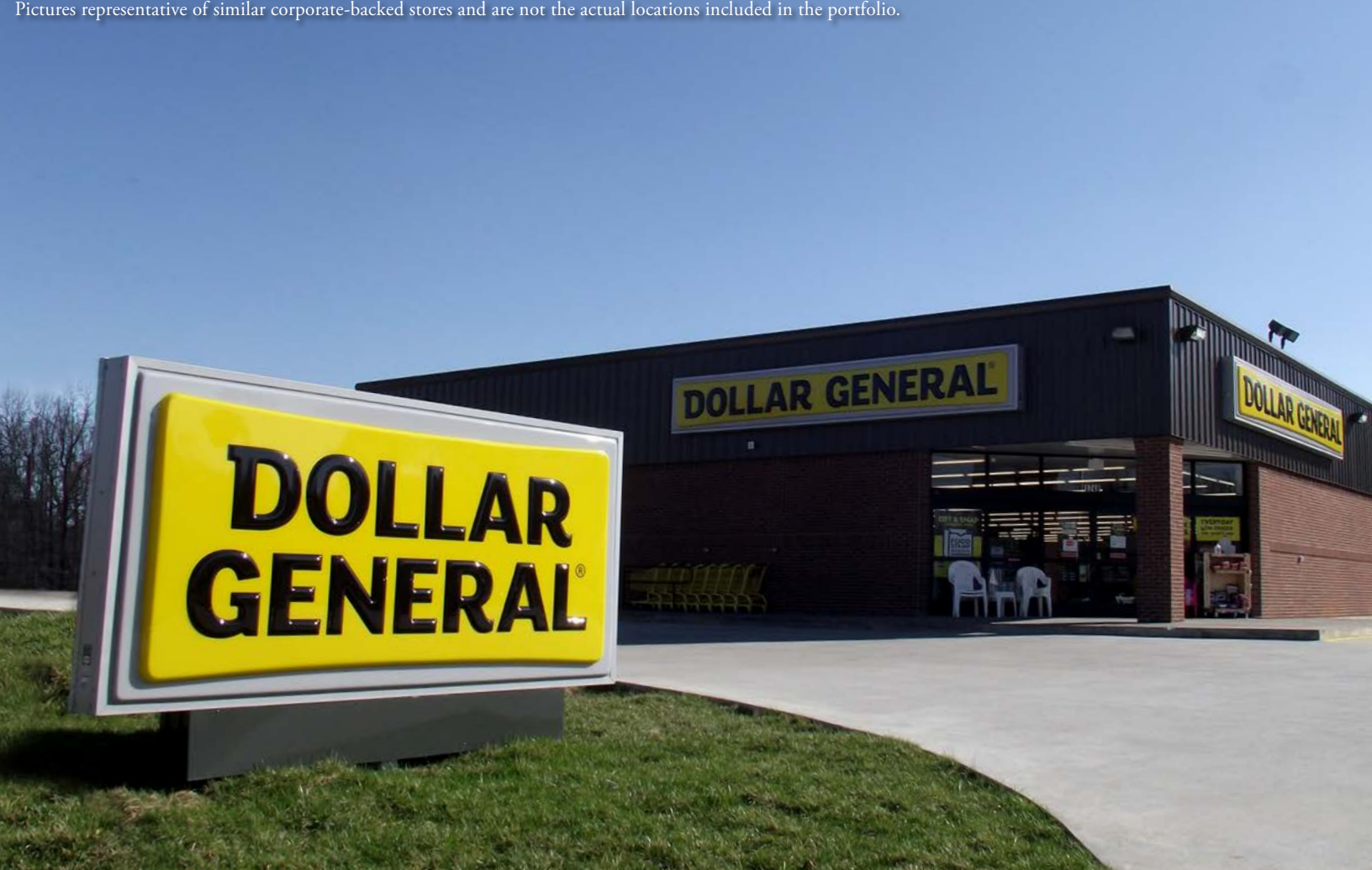
Pictures representative of similar corporate-backed stores and are not the actual locations included in the portfolio.