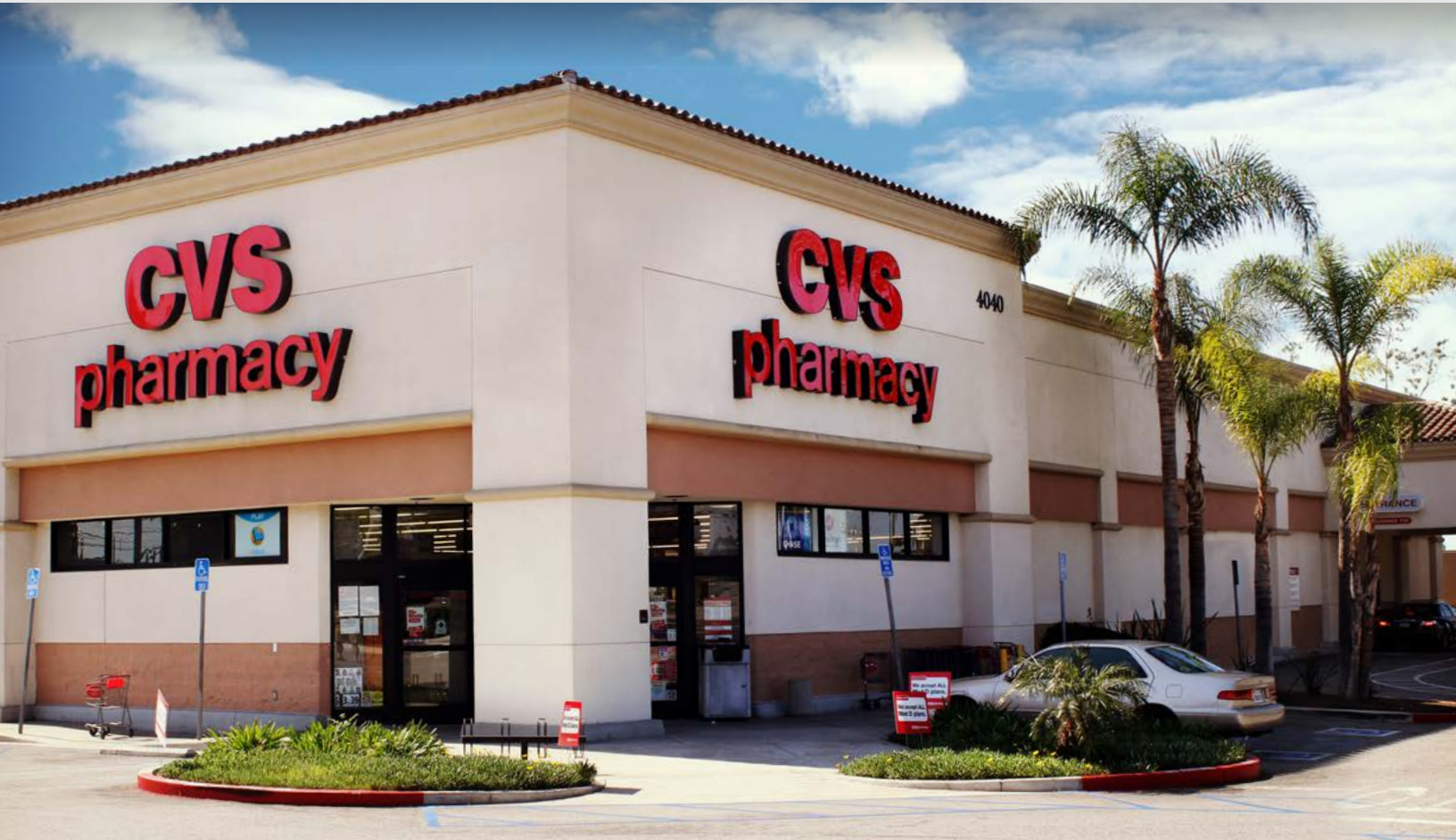
Pictures representative of similar corporate-backed stores and are not the actual locations included in the portfolio.