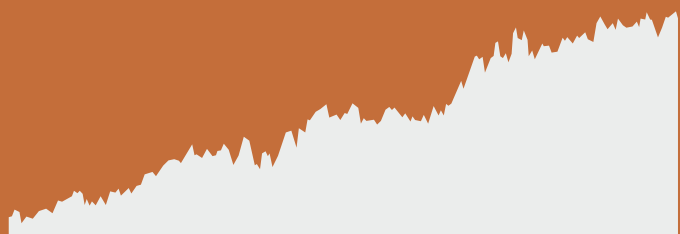
NYSE: GPC - 5-Year Stock Performance

CURRENT ANNUAL NET INCOME: $711.29 MILLION