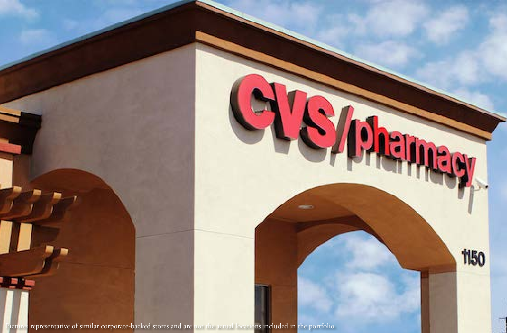
Pictures representative of similar corporate-backed stores and are not the actual locations included in the portfolio.