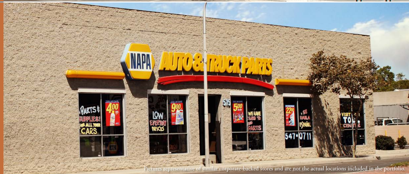
Pictures representative of similar corporate-backed stores and are not the actual locations included in the portfolio.

*Motor Parts and Equipment Corporation is the tenant directly guaranteeing the lease, rather than GPC or NAPA. They are NAPA Auto Parts’ largest distribution operator and enjoy partial financial backing by GPC.