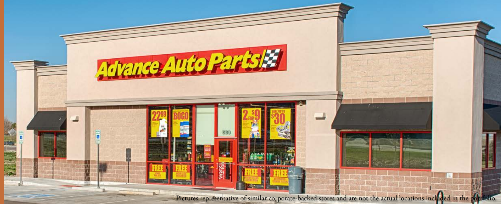
Pictures representative of similar corporate-backed stores and are not the actual locations included in the portfolio.