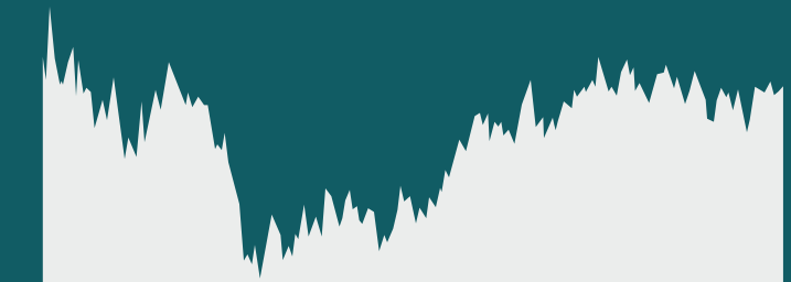
2010 2011 2012 2013 2014 NYSE: TCB - 5-Year Stock Performance

CURRENT ANNUAL REVENUE: $1.31 BILLION CURRENT GROSS PROFIT: $1.23 BILLION CURRENT ANNUAL NET INCOME: $147.18 MILLION 2014 FISCAL YEAR REVENUE GROWTH: 3.07%