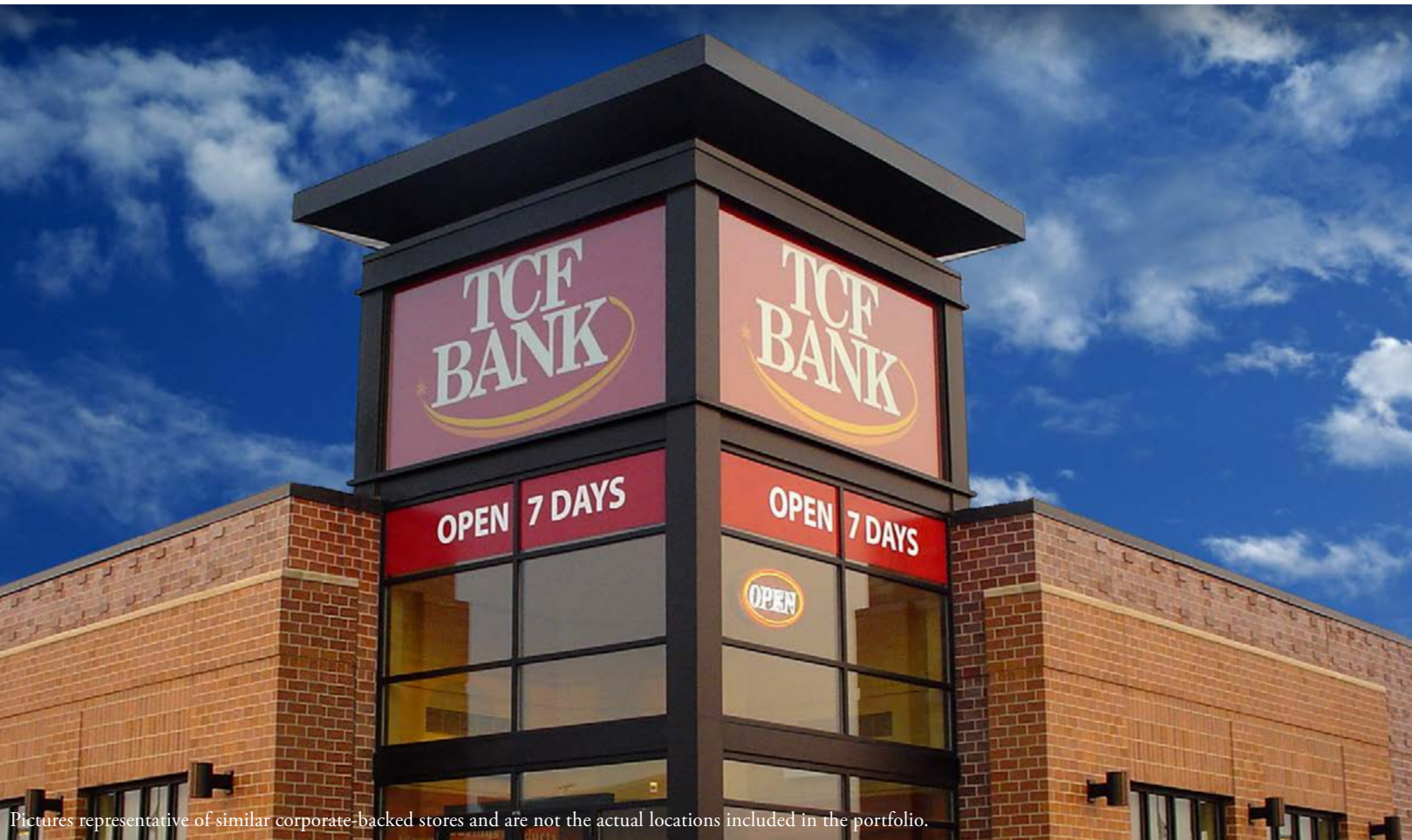
Pictures representative of similar corporate-backed stores and are not the actual locations included in the portfolio.

Investing in this offering involves risk. Please review the Private Placement Memorandum in its entirety, including especially the section that outlines the risks of this offering, before making any investment decision.