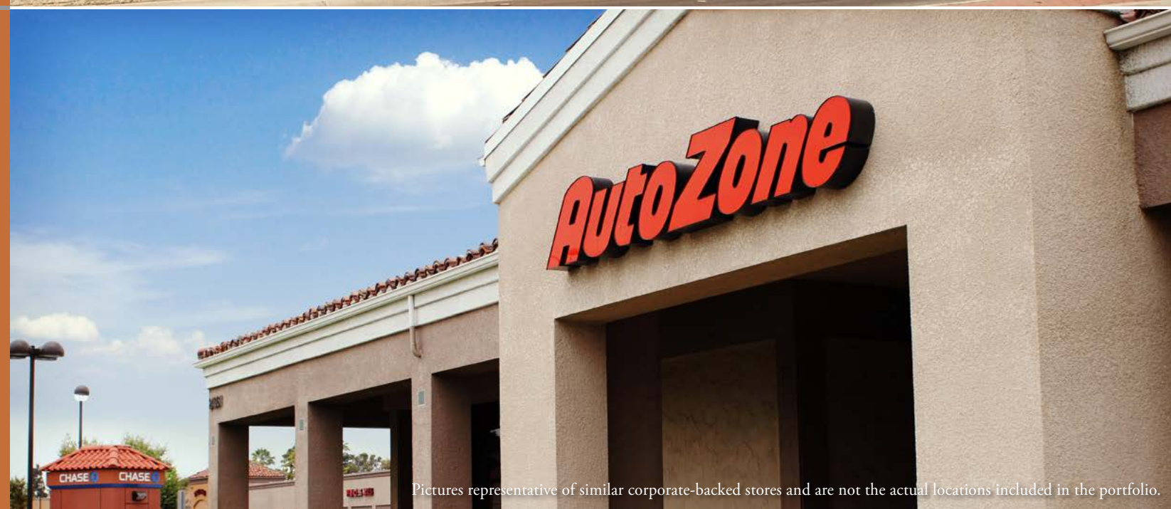
Pictures representative of similar corporate-backed stores and are not the actual locations included in the portfolio.