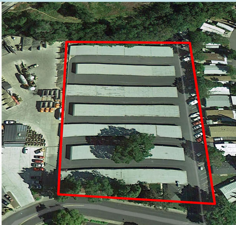
109 Aegean Way, Vacaville, CA 95687