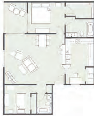
2 Bedroom / 2 Bathroom 1,067 SF (184 Units)