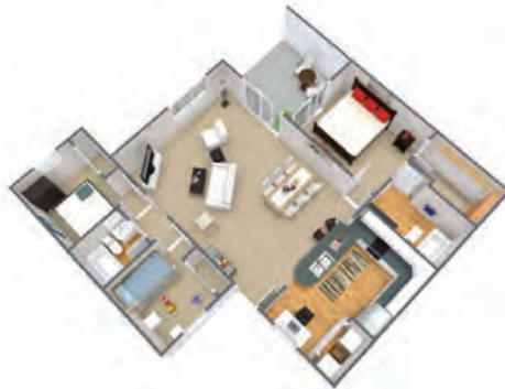
3 Bedroom / 2 Bathroom 1,182 SF (24 Units)