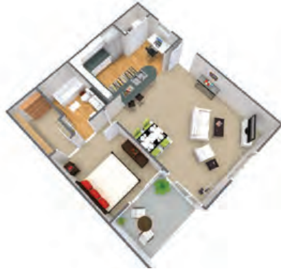
1 Bedroom / 1 Bathroom 820 SF (24 Units)